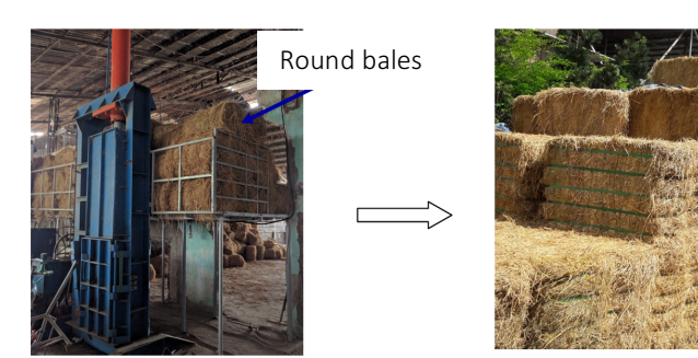
Figure 1. Rice straw compacting

The experiment was conducted using the compacting system (Fig.1) at Binh Minh Group, Cai Lay Town, Tien Giang Province. The machine compacts the 11 small round straw bales with a density of 87.4 kg.m<sup>-3</sup> into one larger and denser cubic-bale in each batch. Five replications were conducted to investigate the performance parameters such as compacting capacity, power consumption, and compacting density.