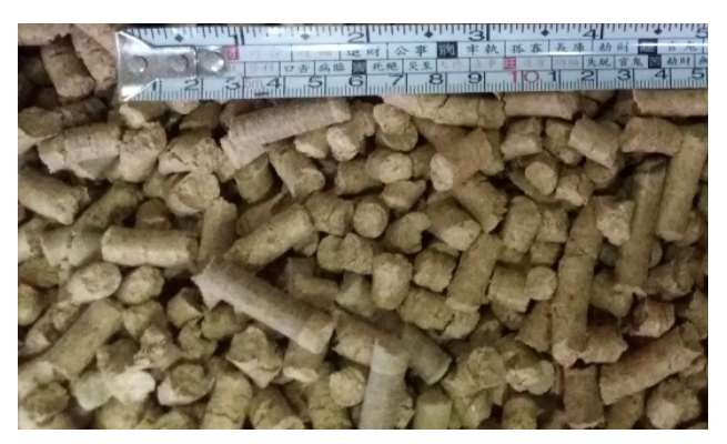
Figure 7. Rice straw pellets

Pelleted products are shown in Figure 7. The length of the straw pellets was in the range of 2-3 cm. The final moisture content (wet basis) of pellets was from 7.53 to 7.97%. The density of the straw pellets was 666 kg.m<sup>-3</sup>. In addition, the average specific mass of a straw pellet was identified at 1,244 kg.m<sup>-3</sup>, higher by 1000% than that of loose straw. This product also has another advantage such as preventing straw floating in water in some further processing such as anaerobic digestion.