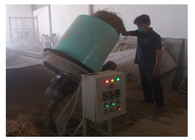
Figure 3. Rice straw rotating chopper

the experiment, we used the existing rice husk grinder (Figure 5) and pelletizer (Figure 6) for corresponding processing processes of rice straw.