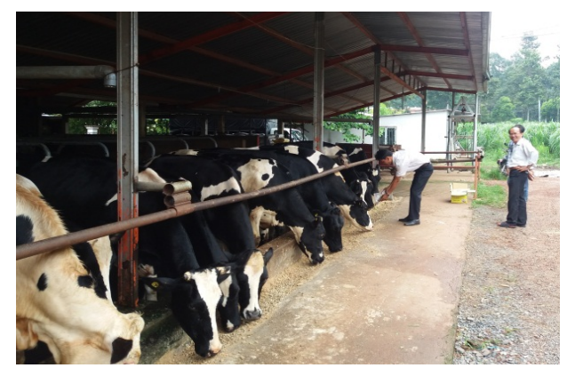
Figure 8. Feeding cattle with straw pellets