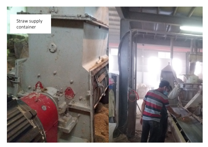
Figure 5. Rice husk grinding machine